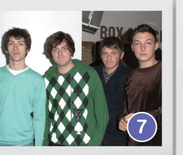
The Arctic Monkeys